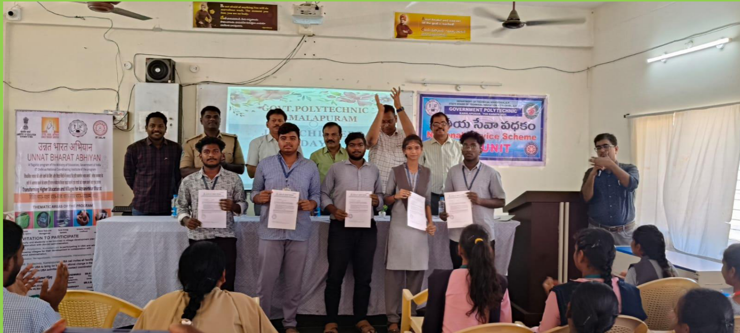
Final Year students of DEEE Received Employment Appointment orders

The event was a moment of pride and joy for the students, faculty, and parents, showcasing the institution's commitment to bridging the gap between academics and employment opportunities. The Training and Placement Cell played a pivotal role in facilitating these job placements, further strengthening the institute's reputation for producing skilled and job-ready graduates.