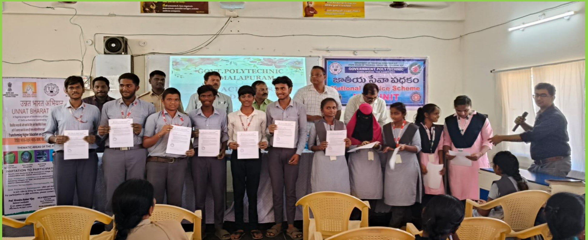
Job Appointment orders received by DECE and DEEE Second year Students of GPT Kamalapuram